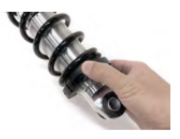
Step 3. With anti-seize applied on your spring retainer threads, set screw installed (hand tight at this point); thread the retainer onto the coilover shock body.