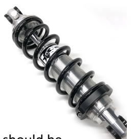
Step 6. Retainer should be tight on the shock body with zero movement or play once installed. Your spring and spring retainer installation is now complete.